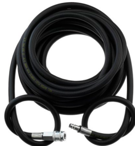
XF Adaptor & XF Coupling