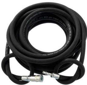
Standard Adaptor & Vertex Coupling