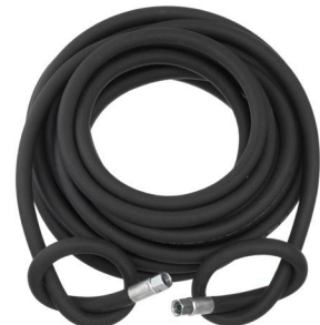
Swivel end fittings