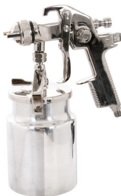
HVLP Suction Spray Gun