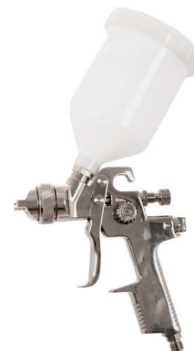
HVLP Gravity Spray Gun