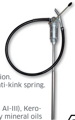
Hand Pump K 10 C